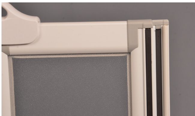
The "free edge" of each door pair has two magnetic strips that seal the overlap connection when the door is closed.