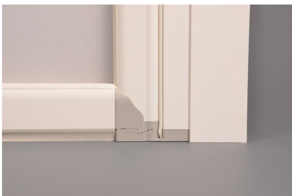
A riser mechanism raises each door pair slightly off the floor as it swings open, either inward or outward.