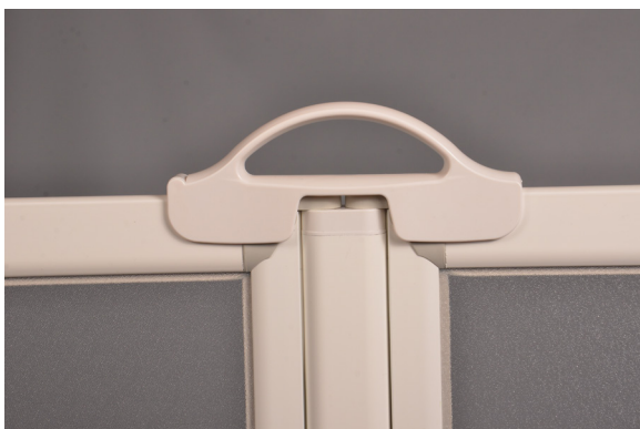
A hinged handle spans each hinge joint to hold the caregiver door straight while in the closed position.